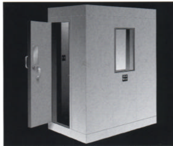
800a Series Audiometric Booth

The 800a Series Single-wall (individual room) construction is a single or multiple occupancy room, constructed of 4 in. thick modular panels with an additional 4 in. thick liner panel, complete with carpeted vibration isolated floor, space-saver roof mounted ventilation, recessed electrical, Noise-lock doors and double glazed windows, audiometric jack panels acoustically matched and shipped ready for field assembly.