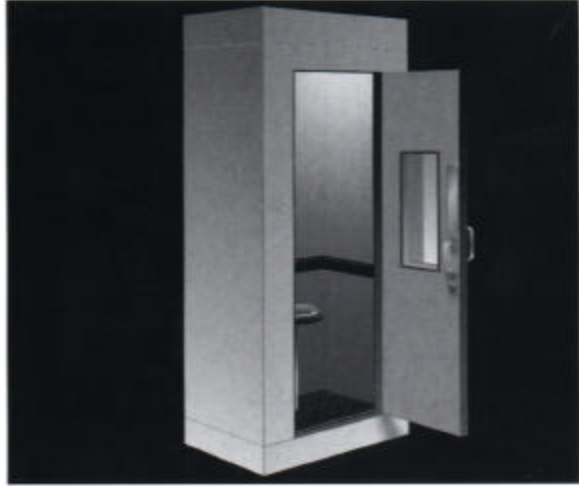
40m/multi-man Series Audiometric Booth

The 40m/multi-man Series Single-wall (individual room) construction is a single or multiple occupancy room, constructed of 4 in. thick modular panels, complete with carpeted vibration isolated floor, space-saver roof mounted ventilation, recessed electrical, Noise-Lock doors and double glazed windows, audiometric jack panels acoustically matched and shipped ready for field assembly.