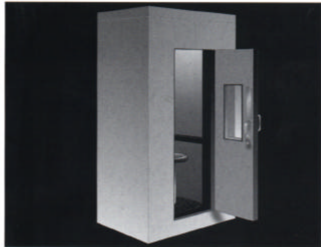
120m/multi-man Series Audiometric Booth

The 120m/multi-man Series Double-wall (individual room) construction is a single or multiple occupancy room, constructed of 4 in. thick modular panels, complete with carpeted vibration isolated floor, space-saver roof mounted ventilation, recessed electrical, Noise-Lock doors and double glazed windows, audiometric jack panels acoustically matched and shipped ready for field assembly.